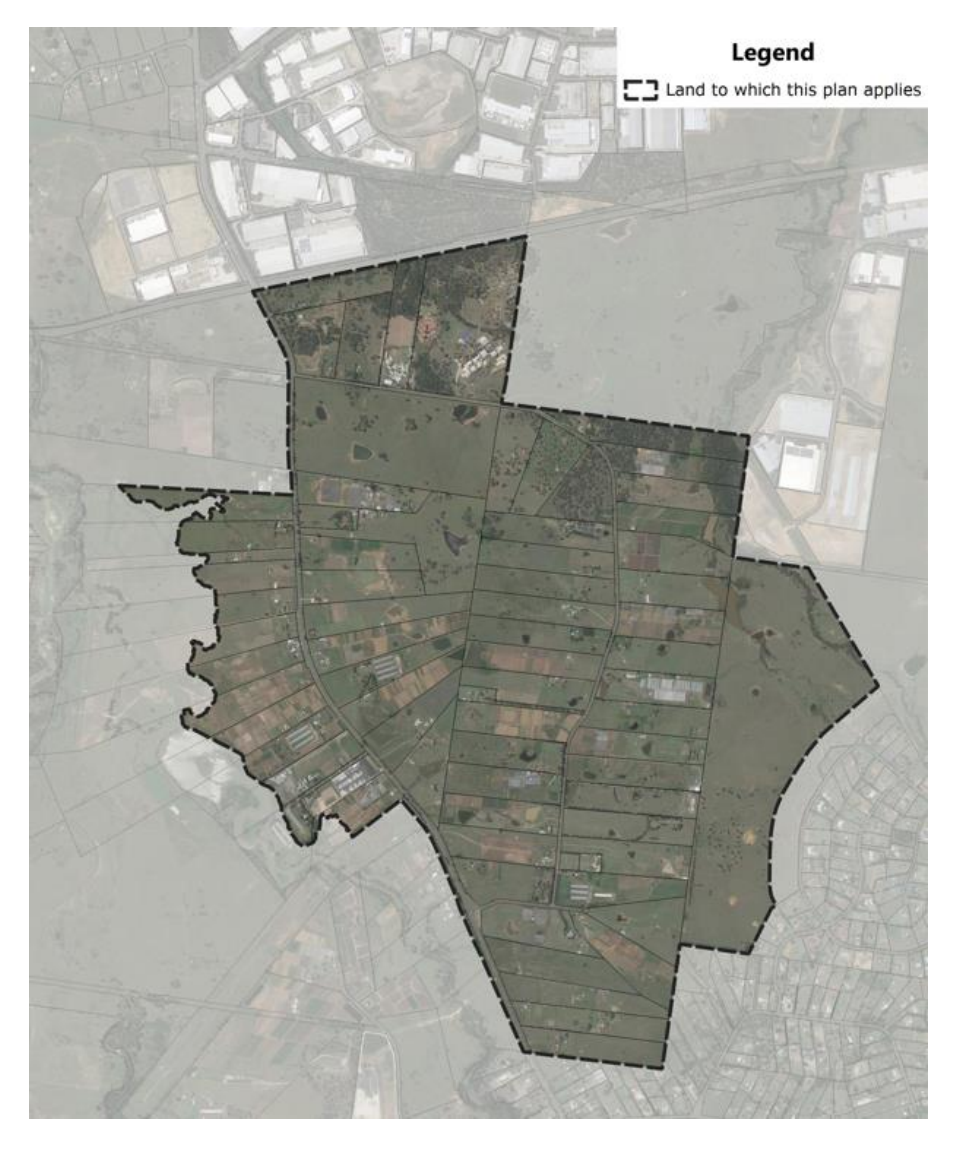
Figure 2 Land affected by this plan (excludes SSD site in north-west corner of the Mamre Road Precinct)