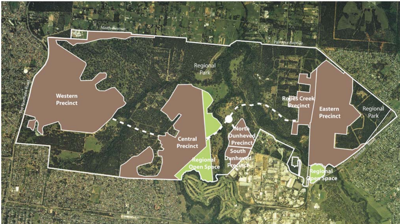
Figure 1 Location Plan of St Marys Development Precincts

The Landscape Maintenance and Handover Plan (LMAH) has been prepared in accordance with the requirements of SREP 30 and the St Marys EPS, and addresses all relevant legislation.