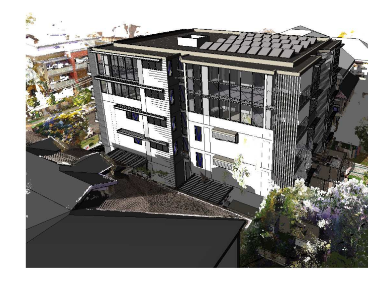
1030 SHADOWS ON 20TH JUNE