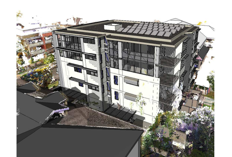
1300 SHADOWS ON 20TH JUNE