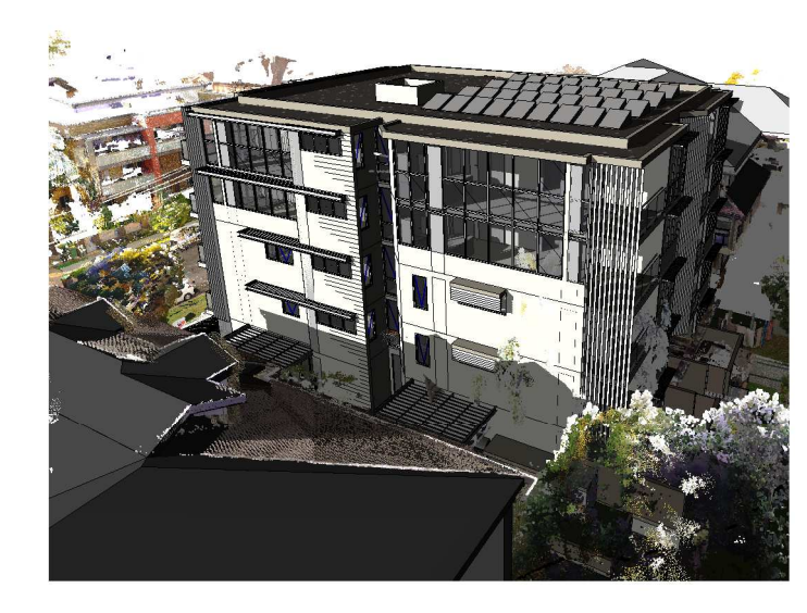
0930 SHADOWS ON 20TH JUNE