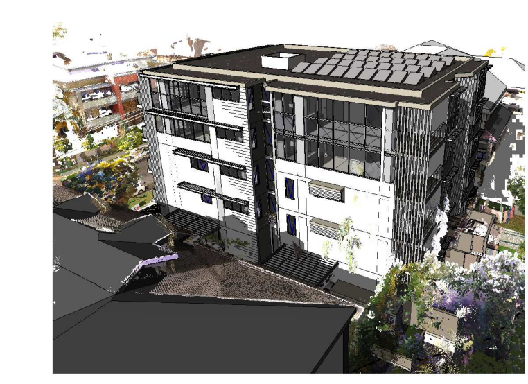
1130 SHADOWS ON 20TH JUNE 6