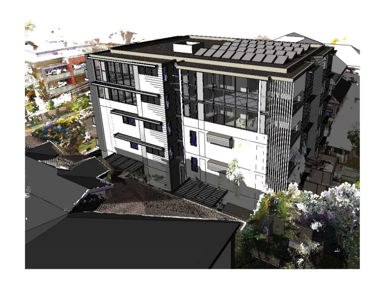
1000 SHADOWS ON 20TH JUNE