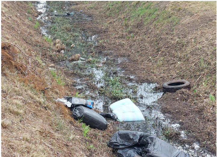
Image 2. Waste dumped in a drainage channel.