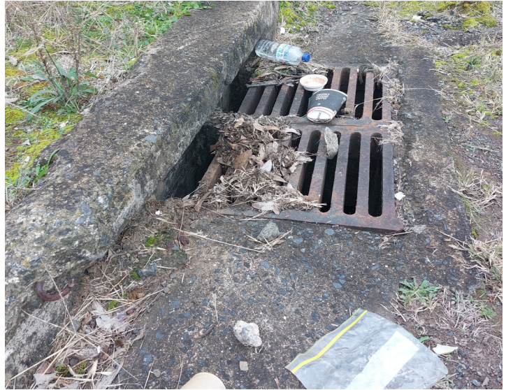
Image 1. Litter accumulating at stormwater drain inlet.