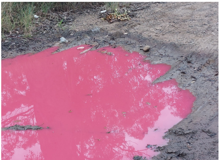
Image 3. Chemical spill turned the water pink.